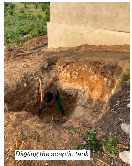
Digging the septic tank

Over the next few weeks, Cassava will be planted which will hopefully bring in a little support for the caretaker.