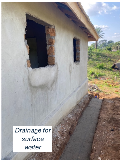
Drainage for surface water

Once the current works are completed, the bathroom will be tiled, the plumbing work in the bathroom completed and the house will be painted. A local well will also need to be dug so that the caretaker and family will have water on site. The cost of these remaining works is around £1,000. If these funds are received the work on the "Caretaker's House" should be finalized by the end of May 2024. As soon as the house is completed, a caretaker will move in who will be responsible for the security of the site.