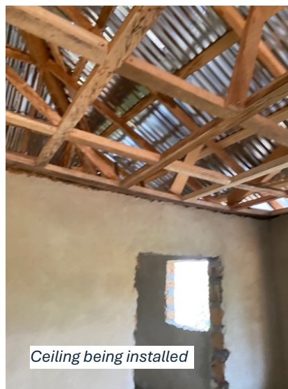
Ceiling being installed