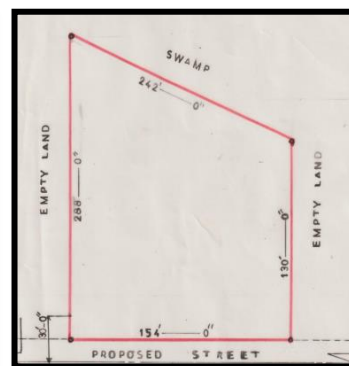
Initial six town lots

Work has already begun in as much as we have constructed the concrete pillars which are placed around the boundaries of the land, this is common practice. We have also purchased tools to begin the work of planting trees around the boundaries, this planting of the trees has now commenced.